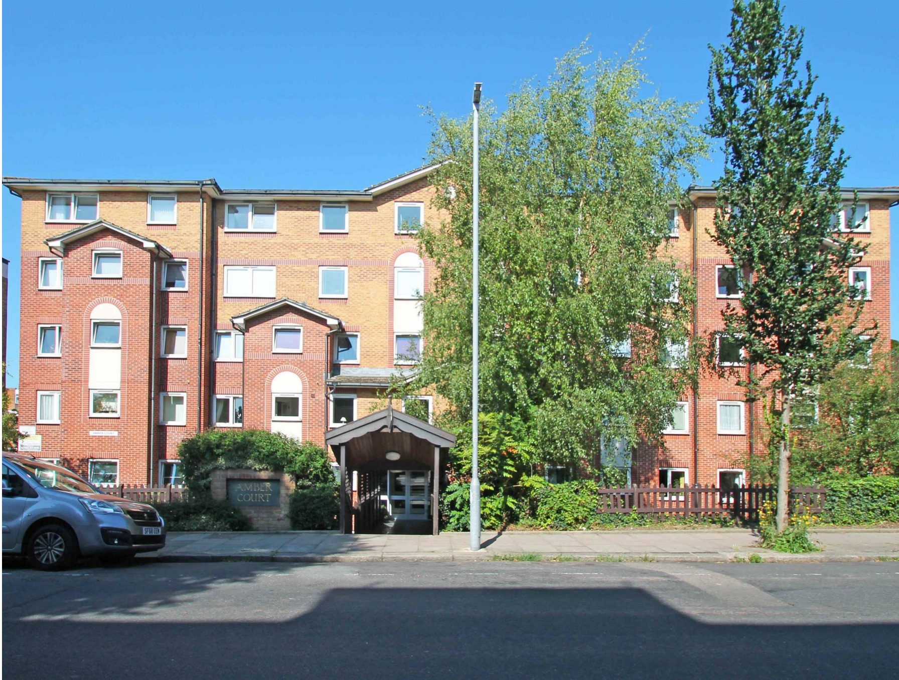
Amber Court, Holland Road, Hove, BN3 1LU £190,000